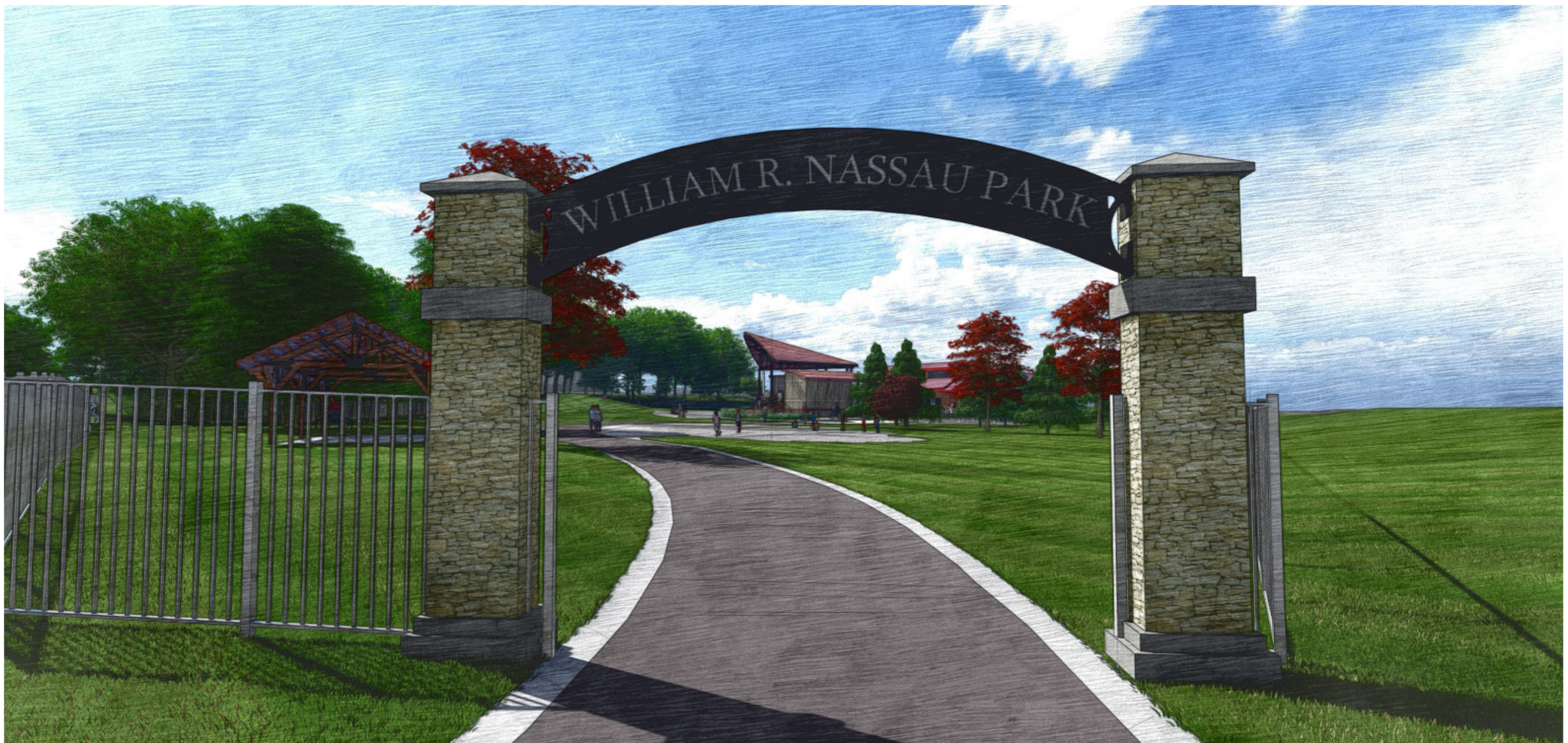
WILLIAM R. NASSAU PARK TOWN OF LOWELL, INDIANA JANUARY 23, 2023