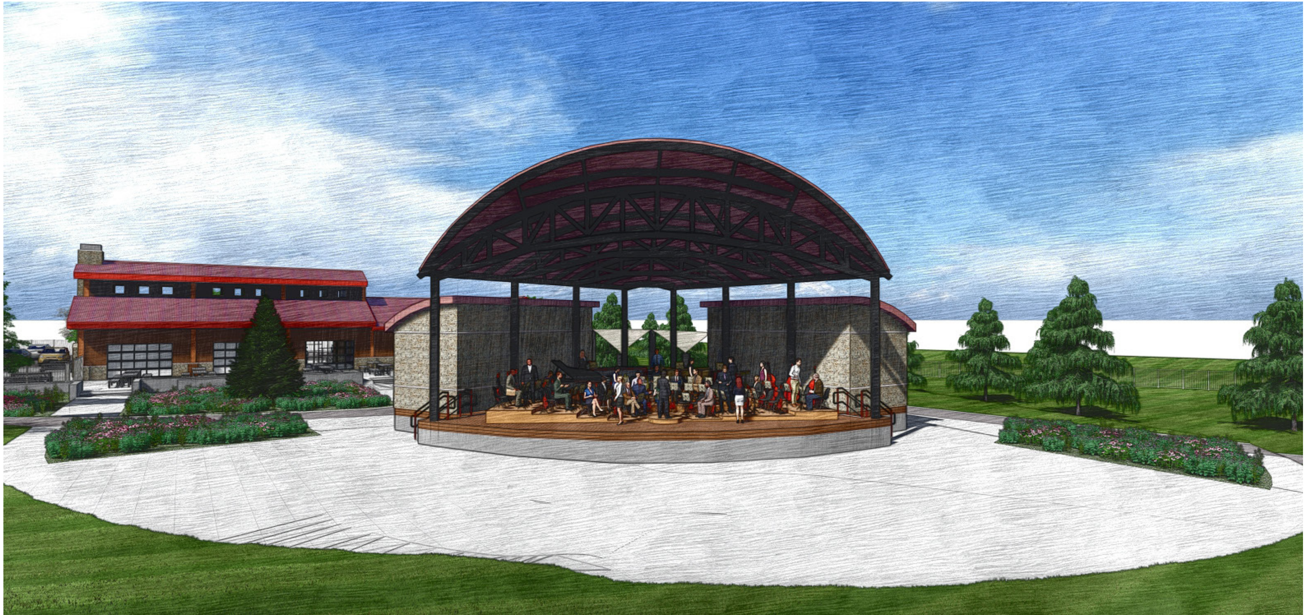
WILLIAM R. NASSAU PARK TOWN OF LOWELL, INDIANA JANUARY 23, 2023